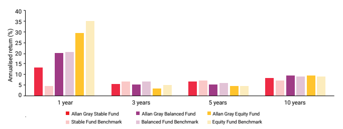
Graph 3: Performance of the Allan Gray Equity, Balanced and Stable Funds

We think that most of these decisions will be proven right over the long term, but of course there is no guarantee.